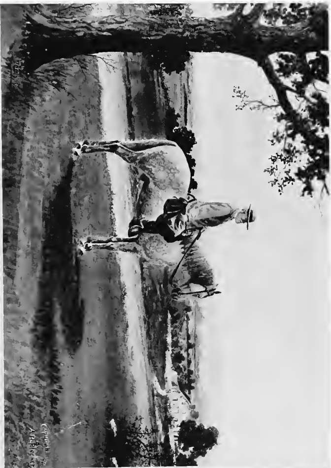
GENERAL ROBERT E. LEE ON HIS HORSE "TRAVELLER," 1867